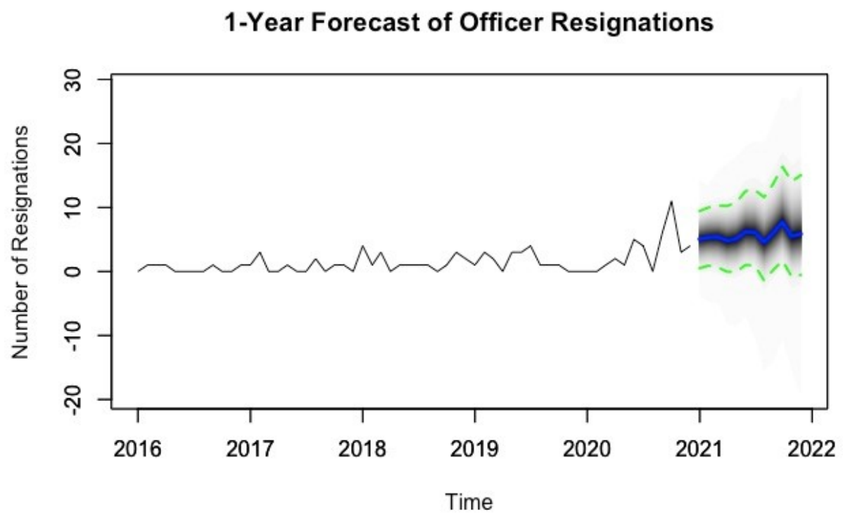
Figure 3: “1-Year Forecast of Officer Resignations”